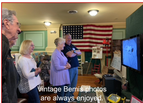
Vintage Bemis photos are always enjoyed.