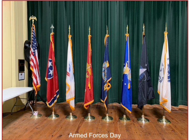
Armed Forces Day