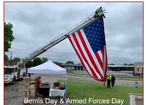
Bemis Day & Armed Forces Day