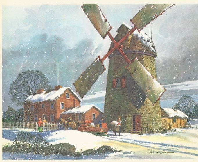
Home Sweet Home Mill, East Hampton, Long Island...1771