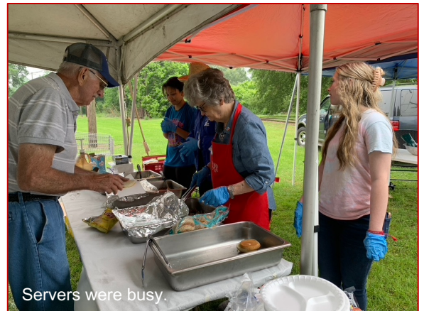
Servers were busy.