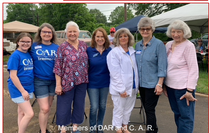
Members of DAR and C. A. R.