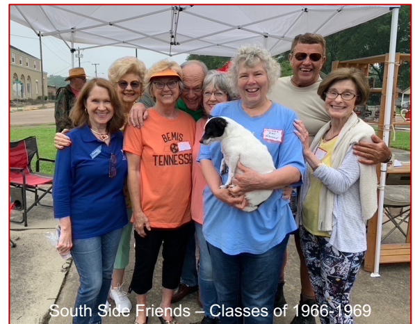
South Side Friends – Classes of 1966-1969