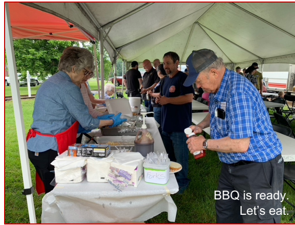
BBQ is ready. Let's eat.