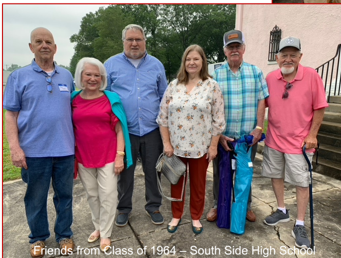
Friends from Class of 1964 – South Side High School