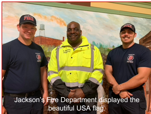
Jackson's Fire Department displayed the beautiful USA flag