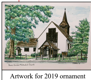
Artwork for 2019 ornament

November 17 – Christmas Memories in Bemis