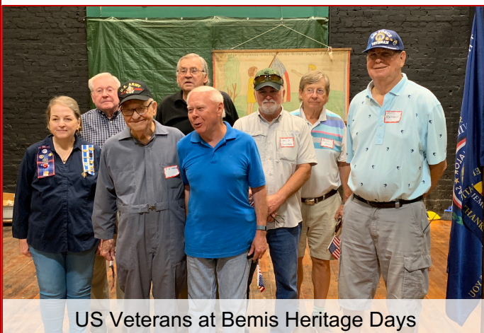
US Veterans at Bemis Heritage Days

Visit the website to view videos of the May 18 ribbon cutting at the Bemis Mill Memorial Park. https://bemishistory.org/