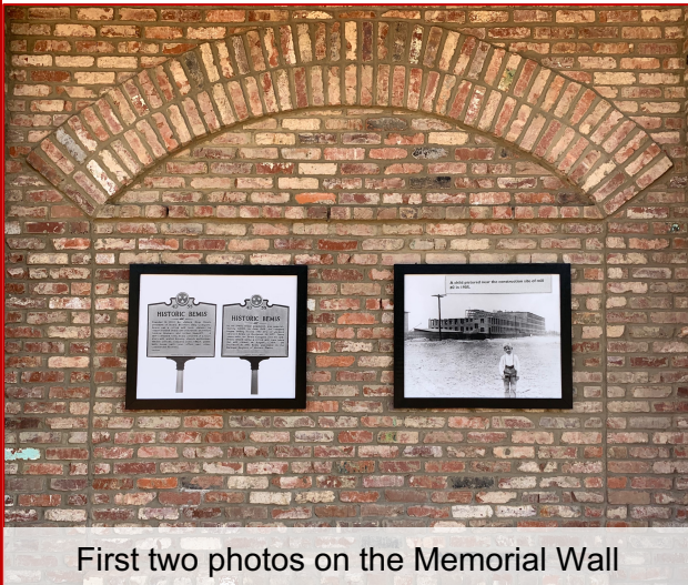
First two photos on the Memorial Wall

The City of Jackson is discussing plans to construct a picnic pavilion at the west end of the park.