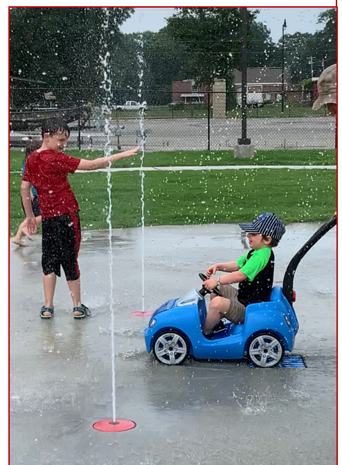
Children enjoyed the splash pad.