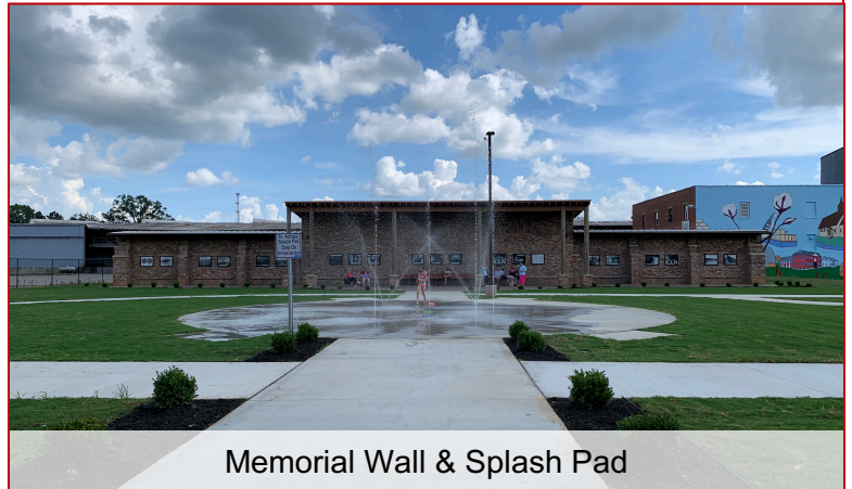
Memorial Wall & Splash Pad